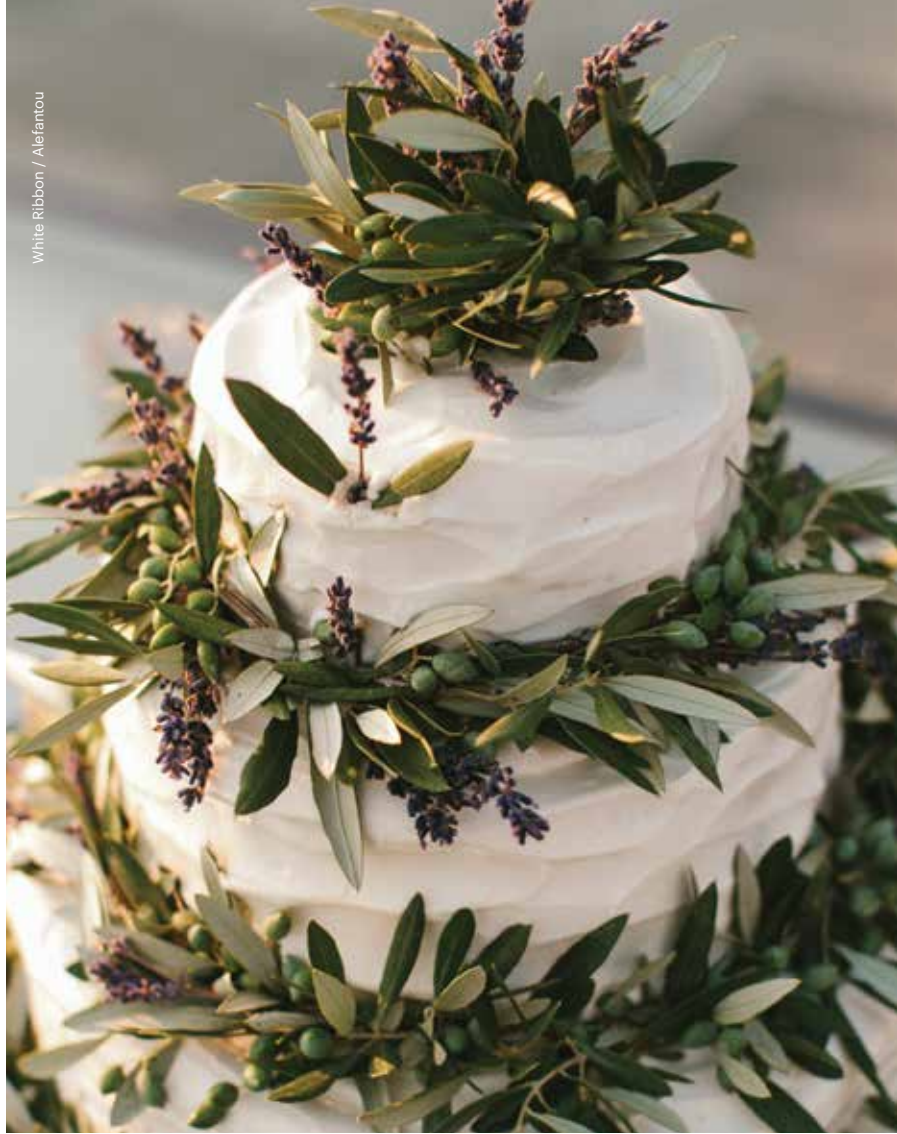
White Ribbon / Alefantou