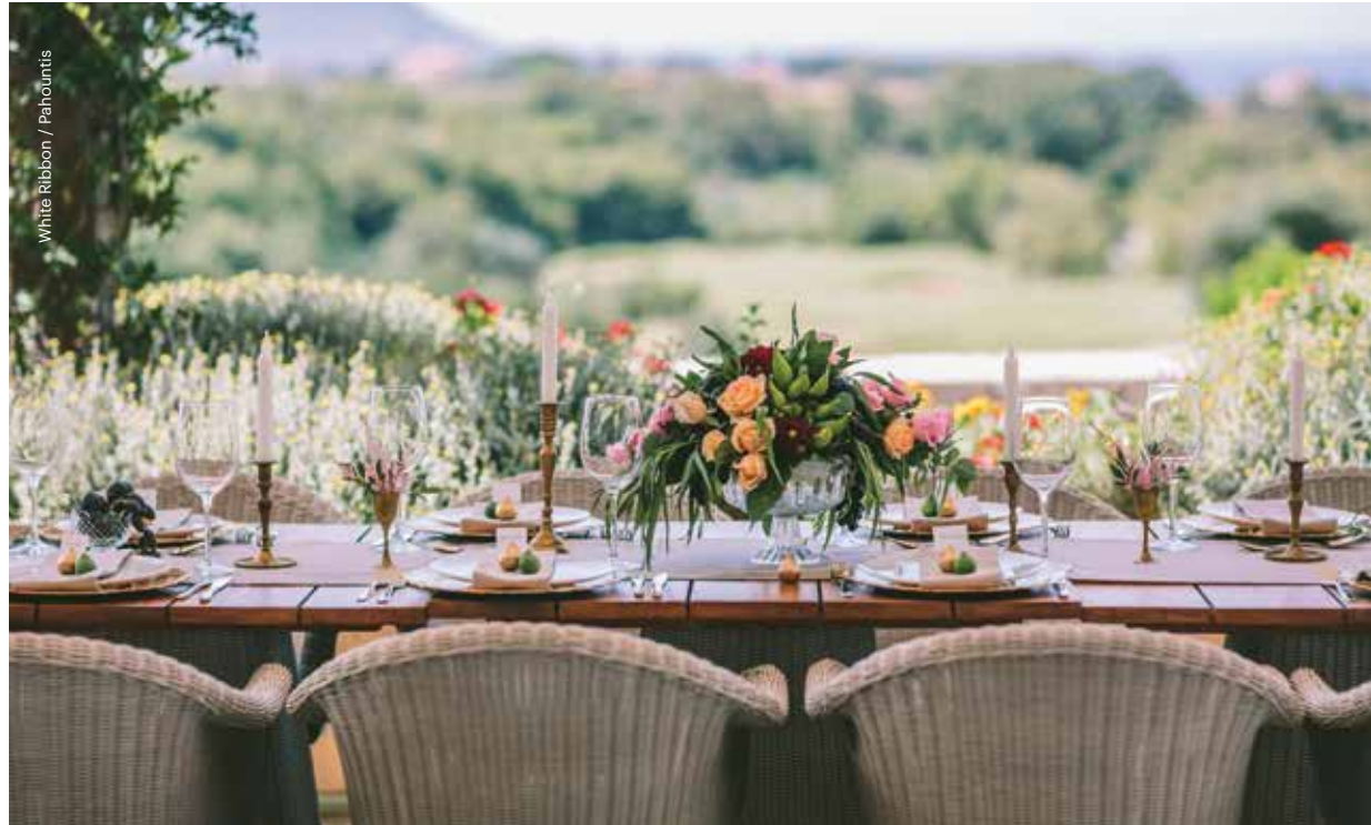
White Ribbon / Pahountis