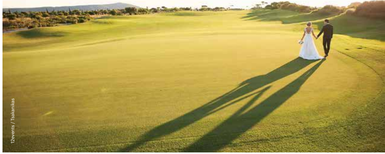
12events / Tsakanikas